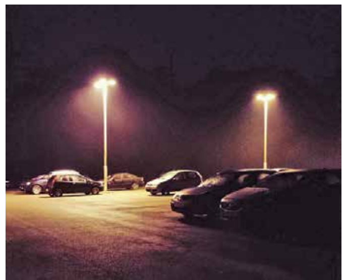
Areas left in shadow will assist criminals

Following a carefully considered risk assessment, an Operational Requirement (OR) should be drawn up that takes account of the identified security issues. Guidance on the preparation of an OR is published by the Centre for the Protection of National Infrastructure (CPNI), and can be found on their website. The advice of a security lighting professional obtained at the outset is likely to improve the chances of a positive and cost-effective outcome.