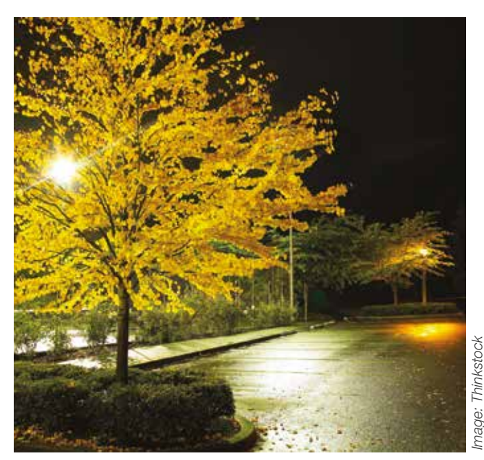
Consider arboreal growth at the planning stage